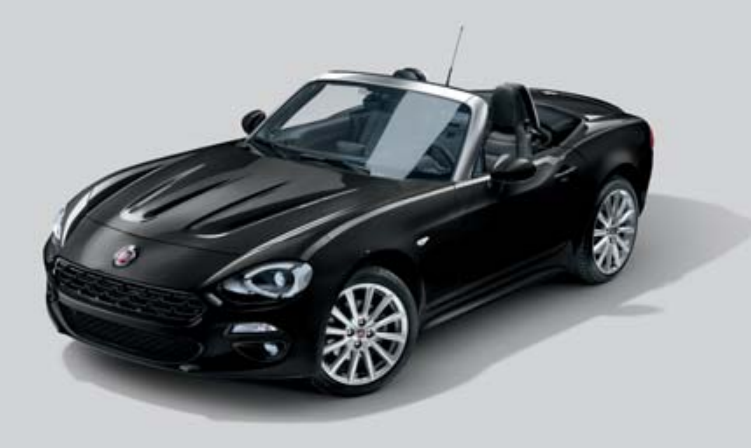
5DN VESUVIO BLACK - METALLIC