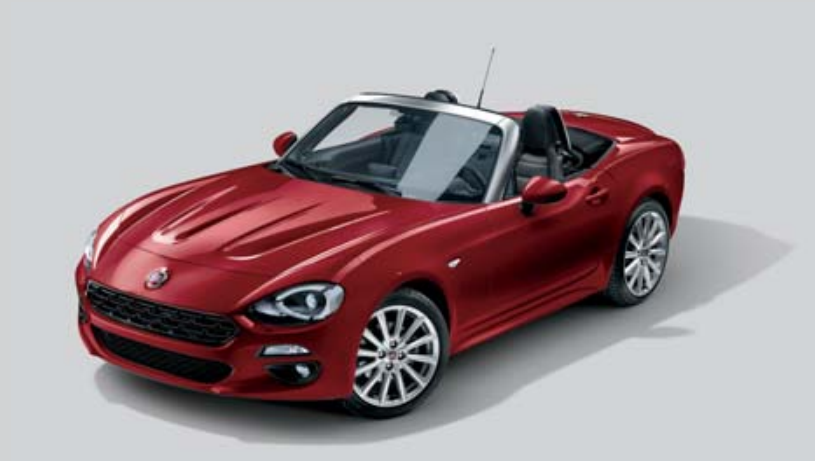
5CA PASSIONE RED - PASTEL