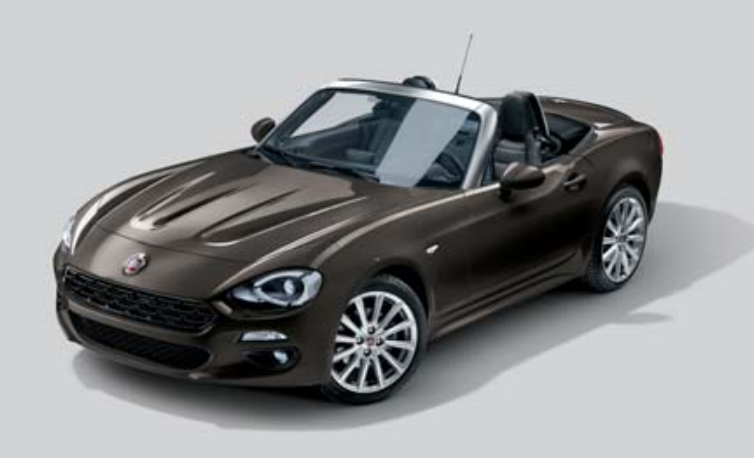
210 MAGNETICO BRONZE - METALLIC