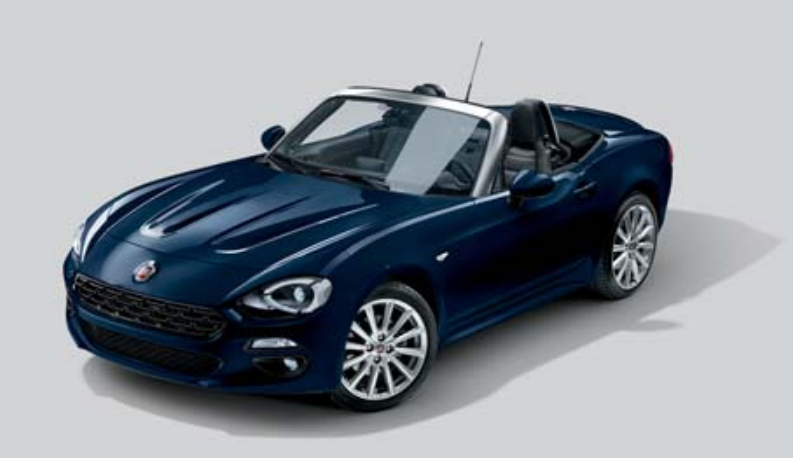
5DQ MEDITERRANEO BLUE - METALLIC