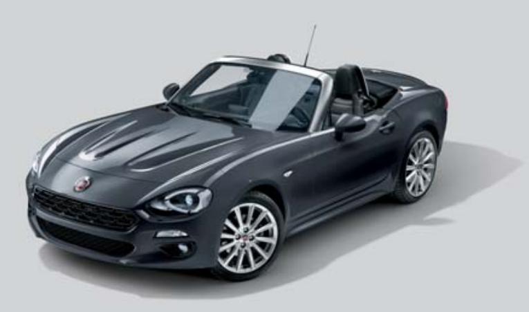
5CE MODA GREY - METALLIC