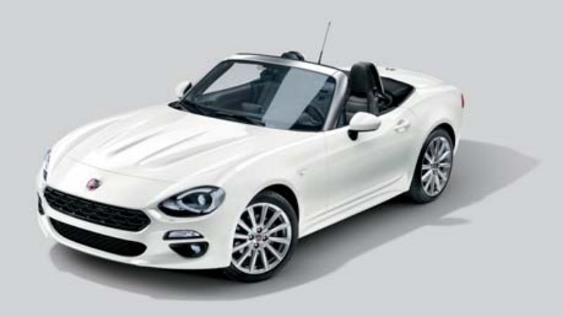
5CB GELATO WHITE - PASTEL