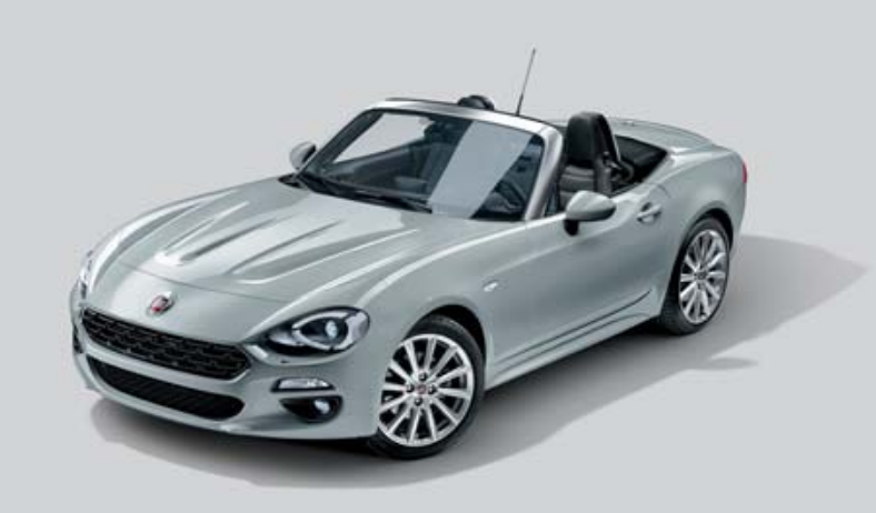
5DP ARGENTO GREY - METALLIC