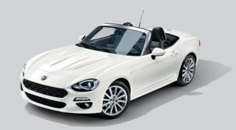
4H5 GHIACCIO WHITE - THREE-LAYER