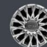
4AV - 15" Alloy wheels glossy silver Club