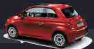
111 Passione Red