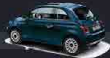
687 Blu dipinto di blu