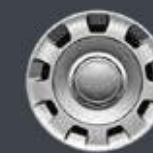
OR5 - 14" Grey steel wheels Cult