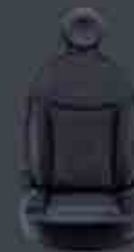
New blue fabric seats with Fiat monogram (Cult-Club)