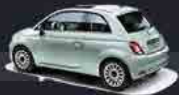
196 Rugiada Green