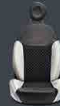
Black Matelassè fabric seats with soft touch details (Dolcevita)