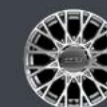
1LR - 16" Alloy wheel glossy silver Dolcevita