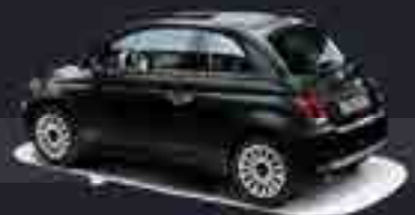
601 Cinema Black