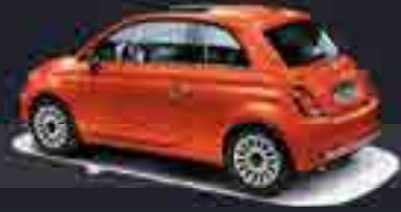
562 Sicilia Orange