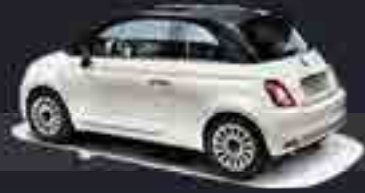
696 Bi-color White/Black roof