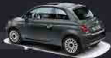
695 Pompei Grey