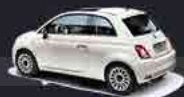
268 Gelato White